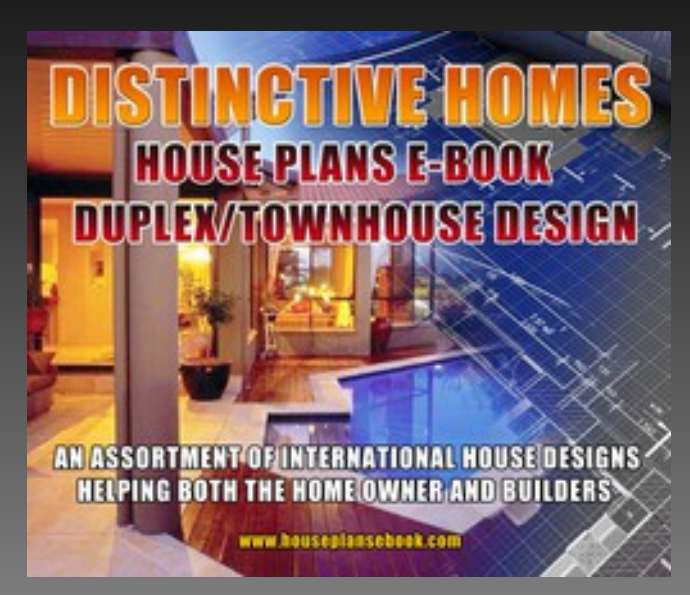
Duplex Designs more details HERE