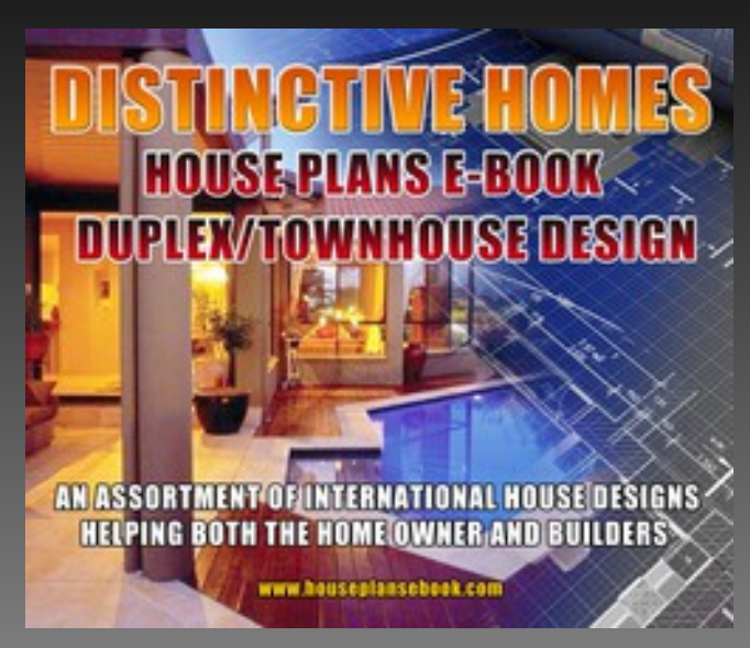
Duplex Designs more details HERE