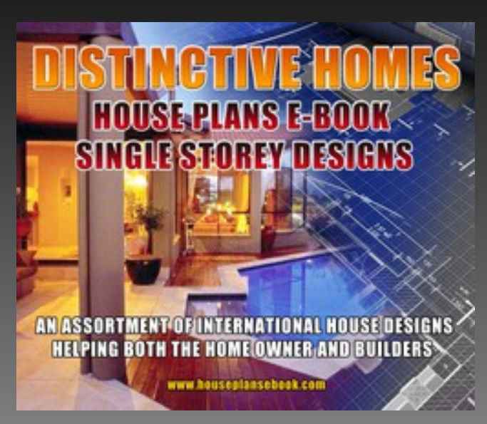
1 Storey Homes Ebook more details HERE