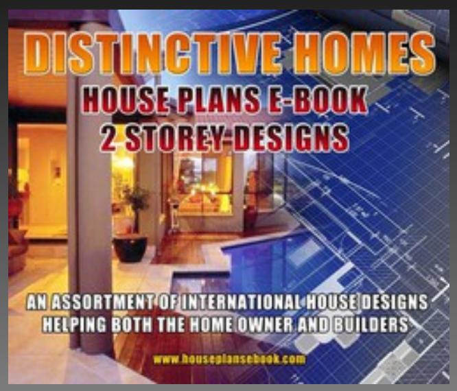
2 Storey Homes Ebook more details HERE