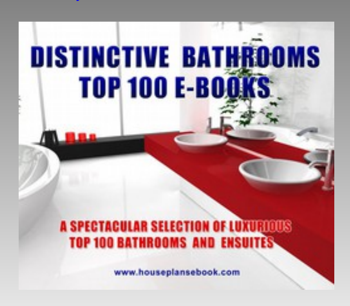
Bathrooms Ebook more details HERE