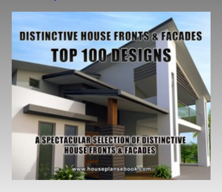
House Facades and Home Fronts details HERE